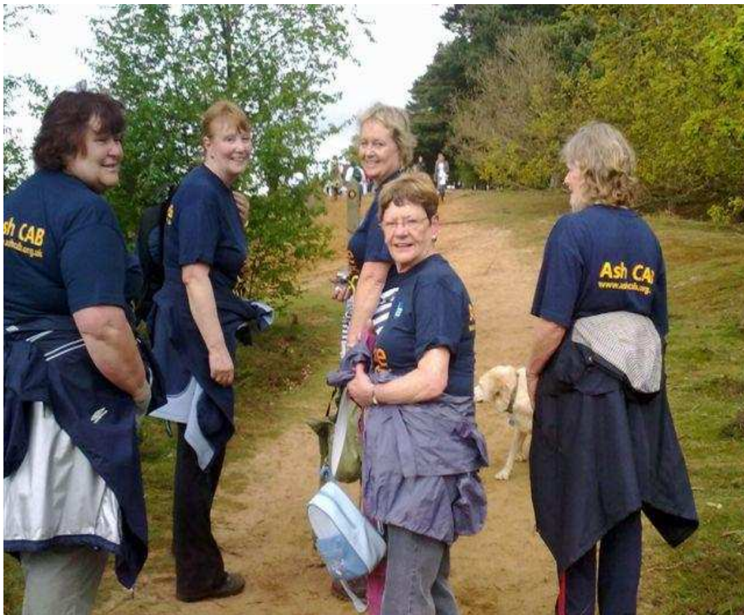
MEMBERS OF ASH CAB AT A RECENT FUNDRAISING EVENT

Fax: 01252 316612 Email: ashcab@cabnet.org.uk Website: www.ashcab.org.uk